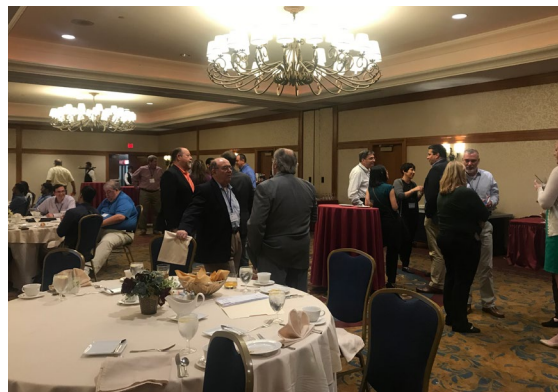
Attendees network at the September program