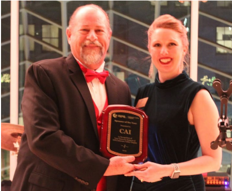
CAI – ISPE DVC 2019 Chapter Sponsor of the Year

ISPE DVC 32nd Annual Holiday Gala : A Starry Night