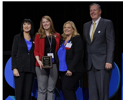
▲ The Affiliate and Chapter Excellence Award recognizes the outstanding work of the International Affiliates and Chapters as reflected by membership development and services, management, industry and society support. This award recognizes the collective contributions of all of our members toward our local chapter, as well as our international community. Delaware Valley Chapter is the 2019 winner.