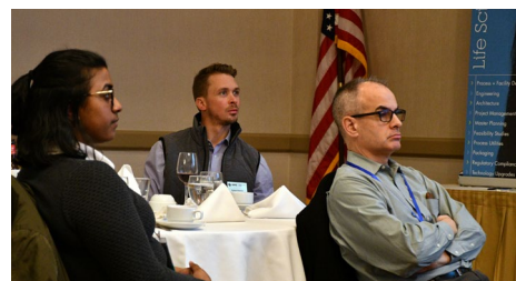
Attendees at the November program