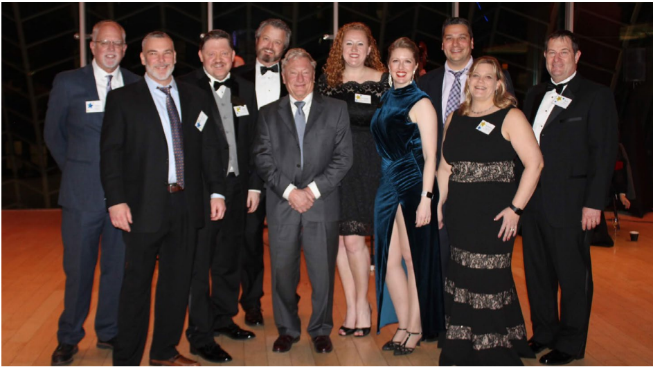
ISPE DVC Past Chapter Presidents